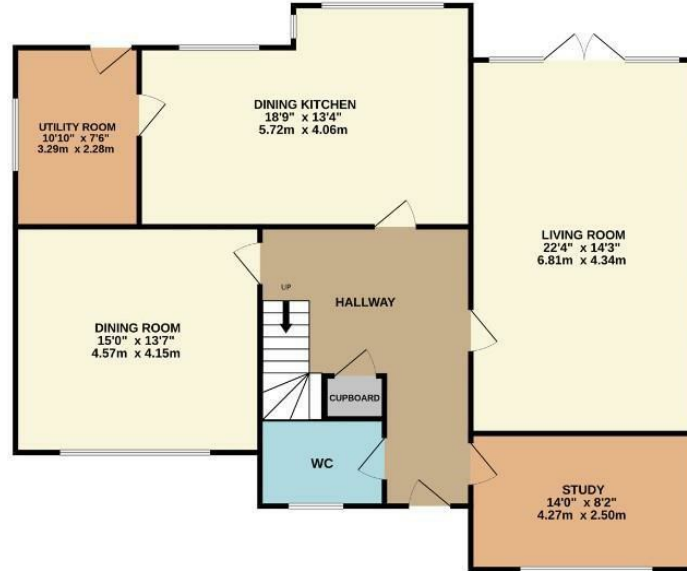
GROUND FLOOR 1197 sq.ft. (107.5 sq.m.) approx.