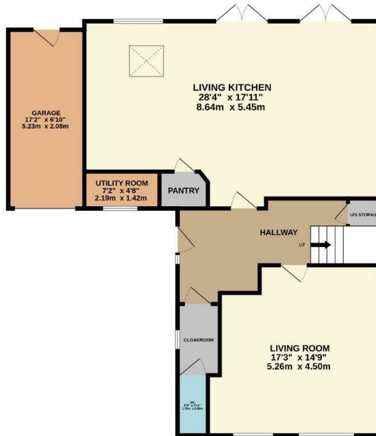
GROUND FLOOR 1051 sq.ft. (97.6 sq.m.) approx.