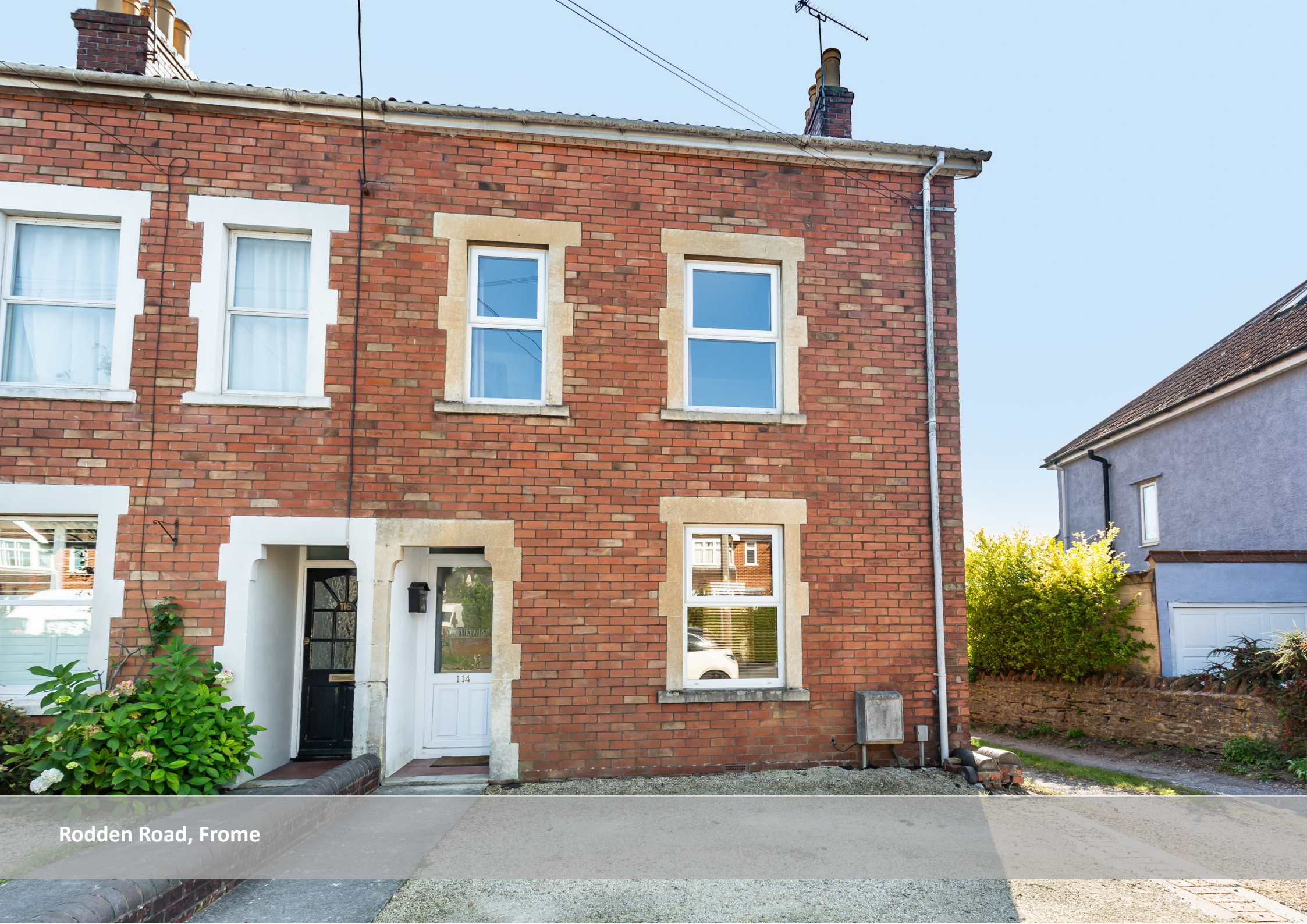
Rodden Road, Frome