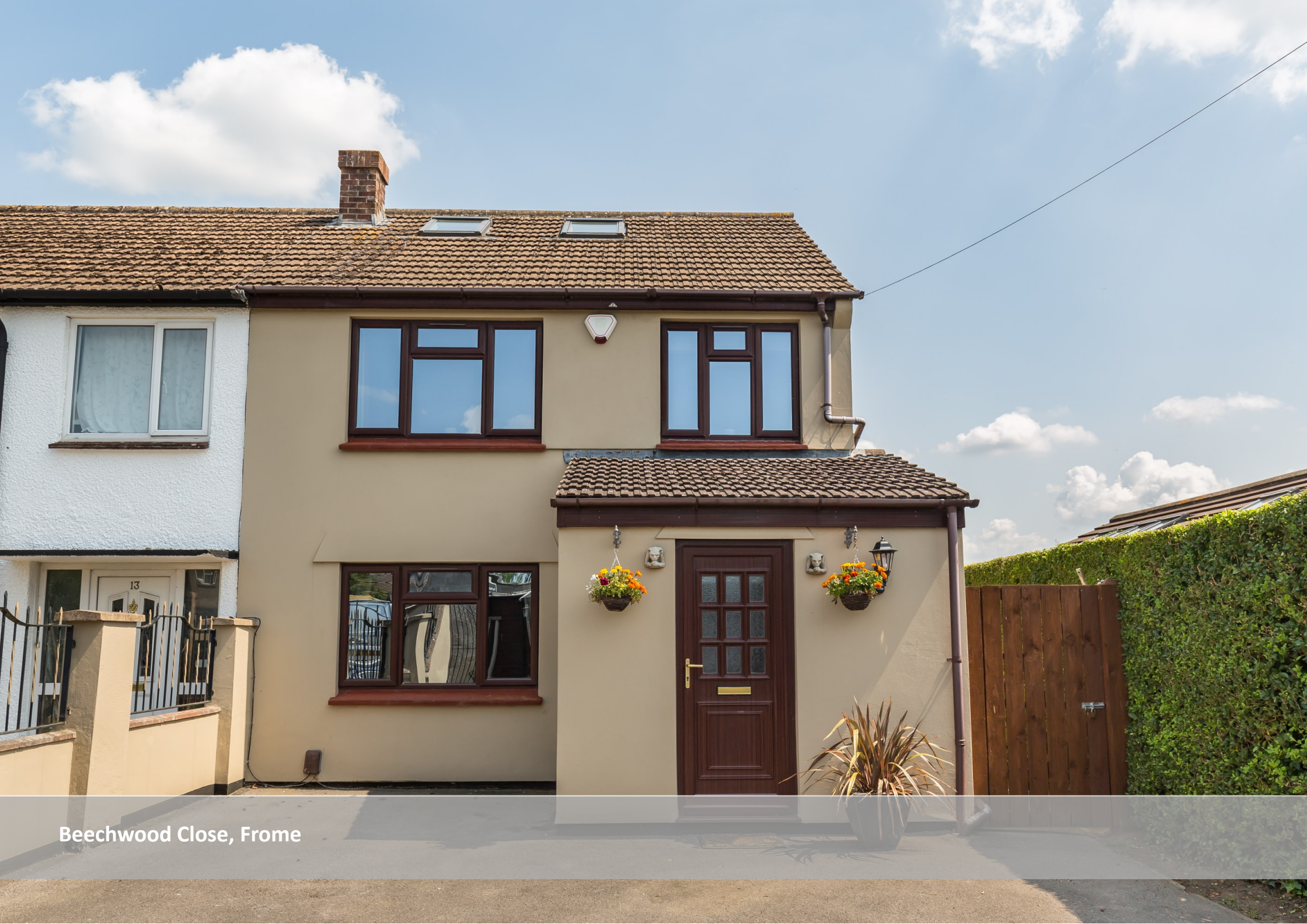
Beechwood Close, Frome