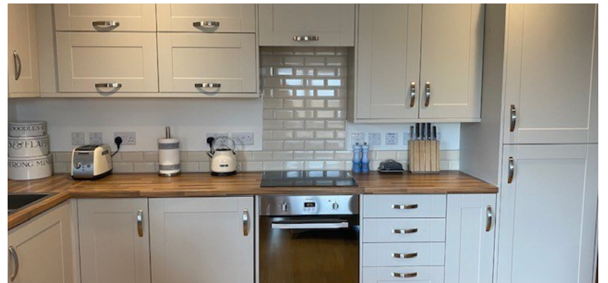
Acacia View, Forest Rd, Frome BA11 2TU