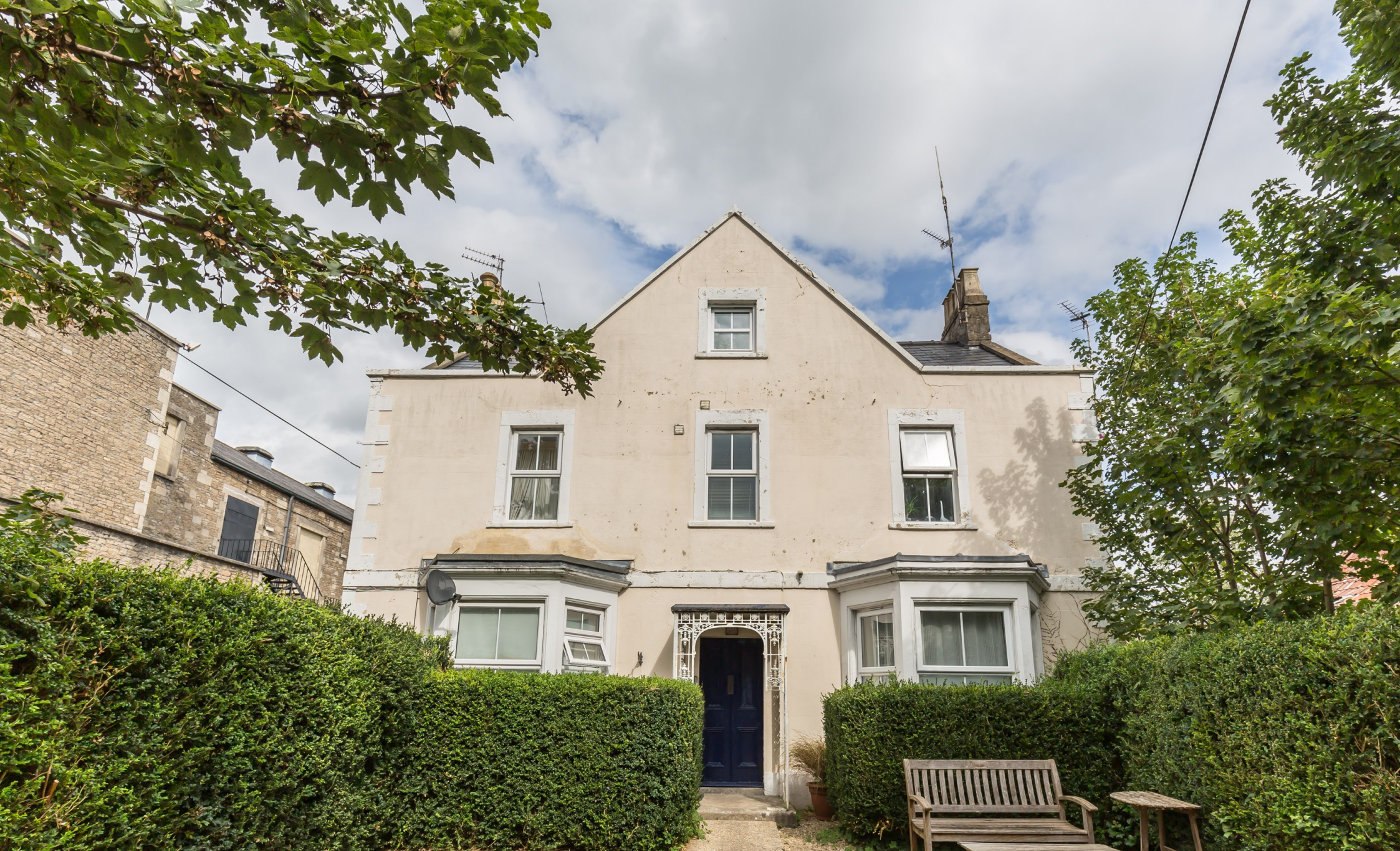
Christchurch Street West, Frome