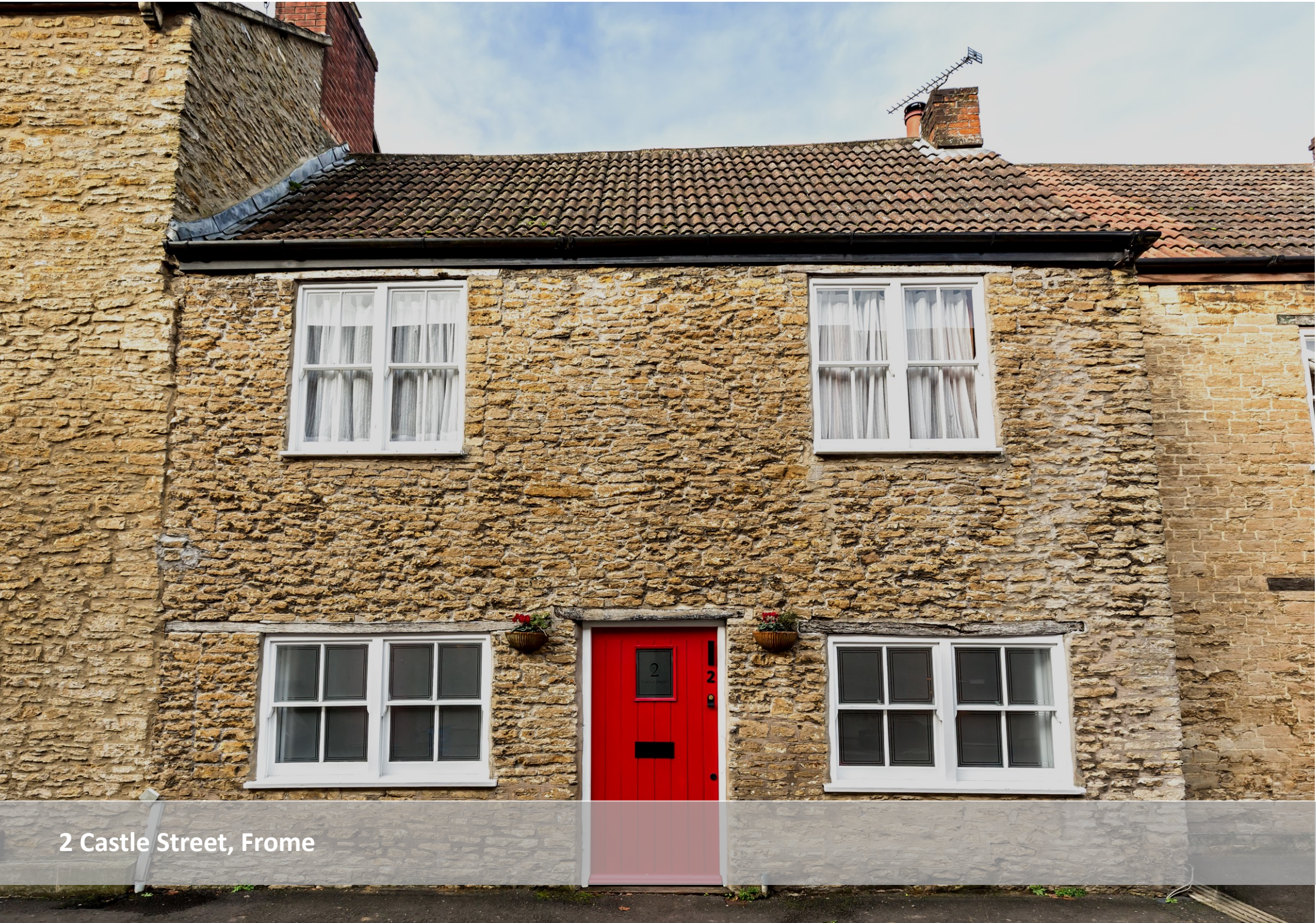
2 Castle Street, Frome