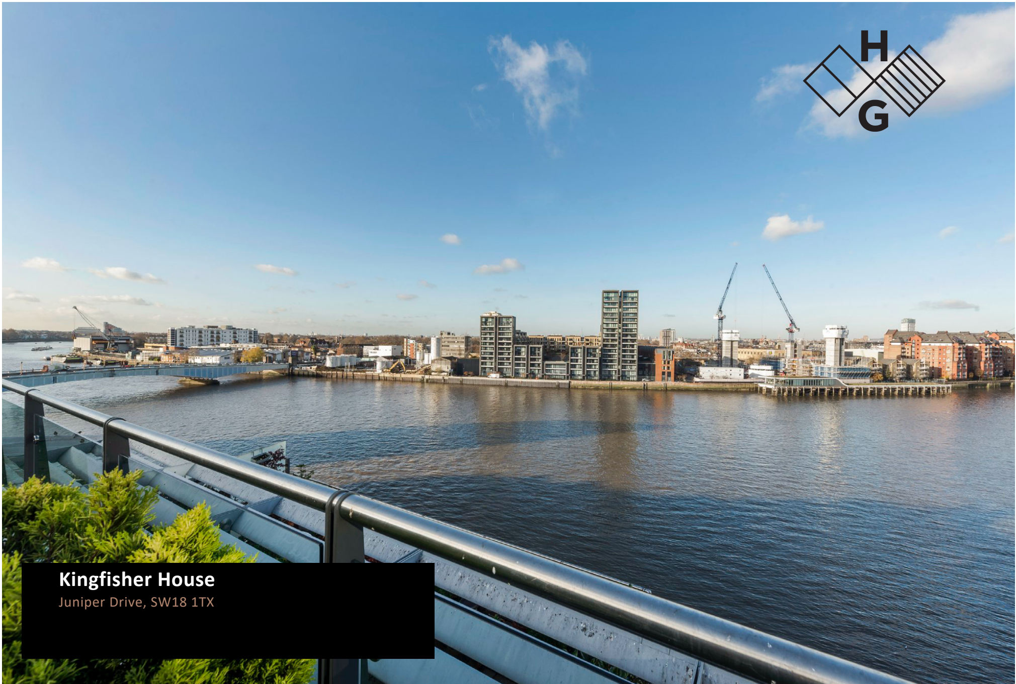
Kingfisher House Juniper Drive, SW18 1TX