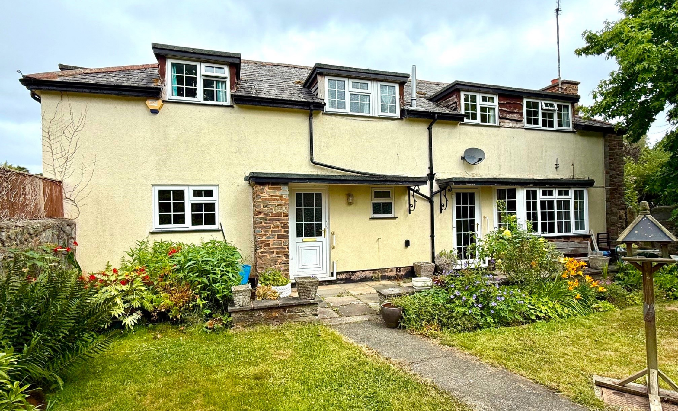
Bridford Mill Cottage, Bridford, EX6 7LB