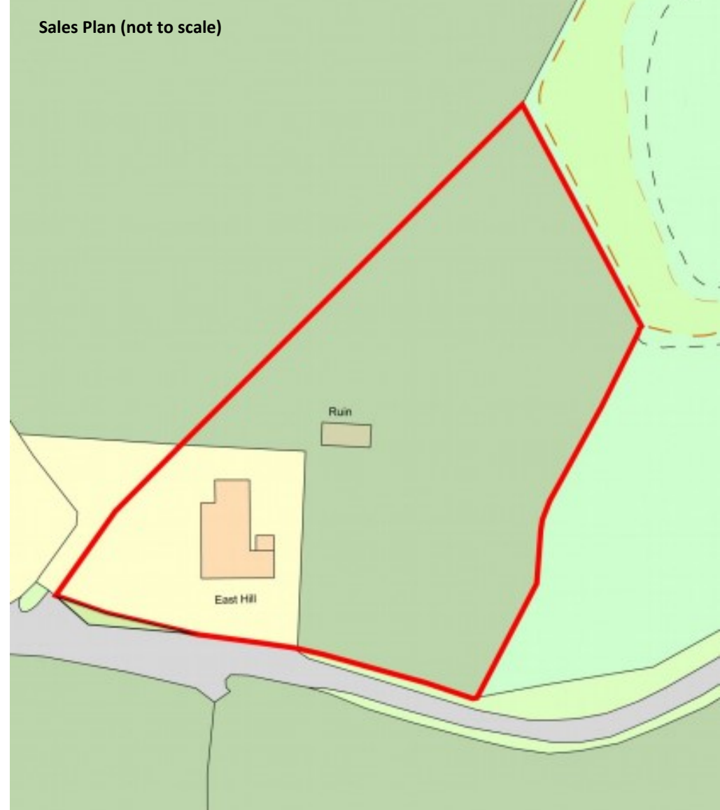
Sales Plan (not to scale)

Total area: approx. 104.4 sq. metres (1123.9 sq. feet)