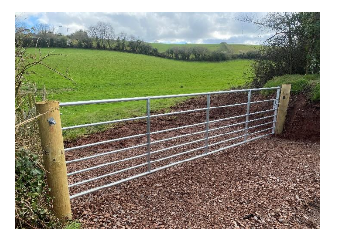
Gateway X (Lots 3 & 4): ///shop.apron.swim

Gateway A (Lots 1 & 2): ///member.tubes.solve