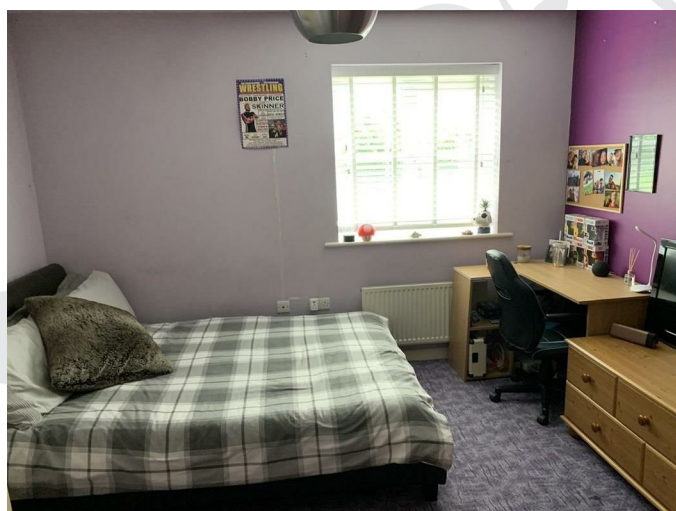
Bedroom 3 13'5" x 11'6" max (4.10 x 3.52m max)

UPVC double glazed window to front elevation, carpet to floor. Sockets, light fitting and radiator.