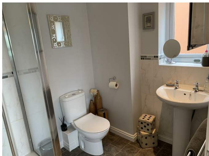
Ensuite 5'10" x 6'11" (1.79 x 2.11m)

UPVC double glazed window to side elevation. A pedestal wash basin, close coupled WC, shower cubicle with glazed door and electric power shower. Part tiled walls, vinyl flooring, Radiator and extractor fan.