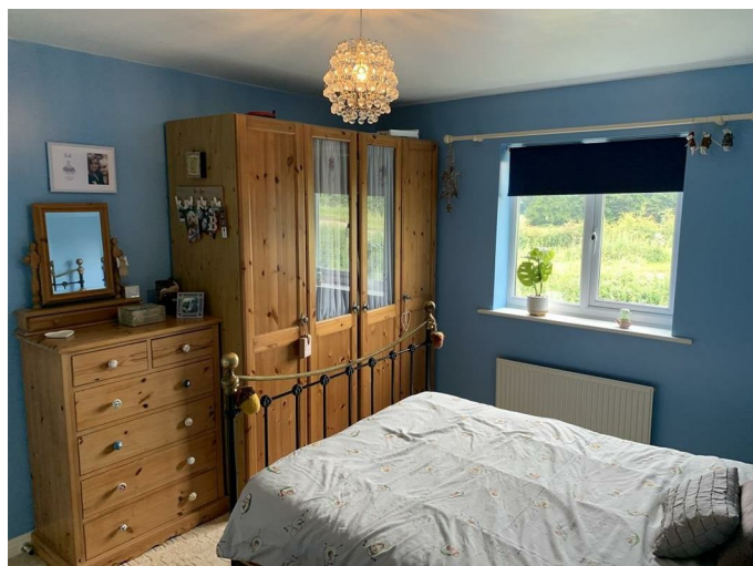
Bedroom 2 10'8" x 12'8" (3.27 x 3.88m)

UPVC double glazed window to rear, carpet to floor. Sockets, light fitting and radiator.