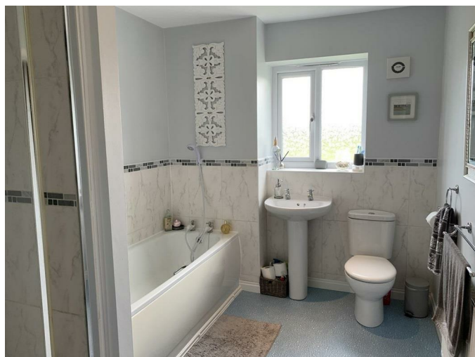
Family Bathroom 10'10" x 7'6" (3.32 x 2.29m)

UPVC double glazed window to the rear elevation. a four piece white suite of panelled bath, separate shower cubicle with electric power shower, pedestal wash basin and close coupled WC. Part tiled walls and vinyl flooring. Inset spotlights to ceiling, radiator and extractor fan.