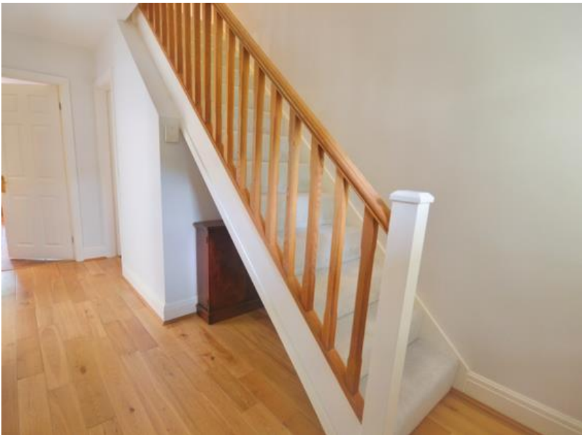
• New decor & Flooring