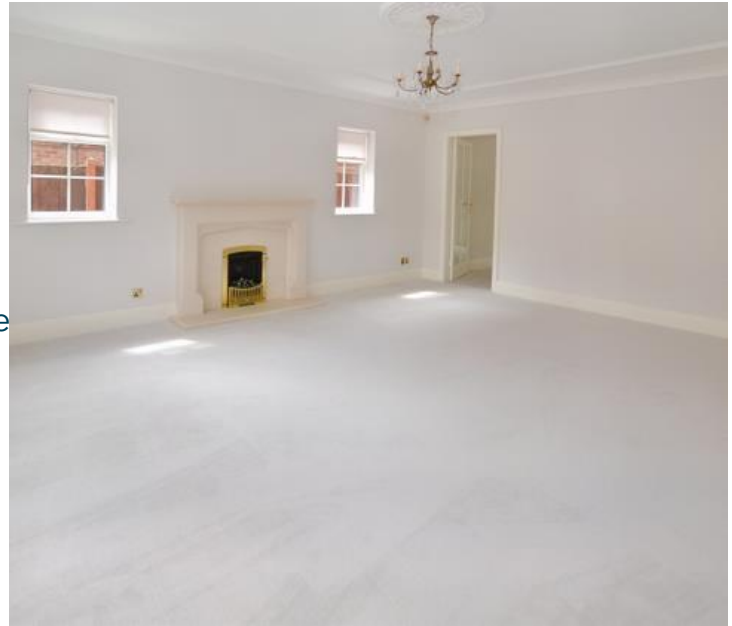
• EPC rating D