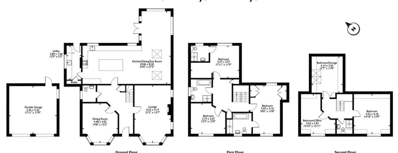
Ground Floor First Floor Second Floor Please note that the location of doors, windows and other items are approximate and this floorplan is to be used for illustrative purposes only. Unauthorized reproduction is prohibited.