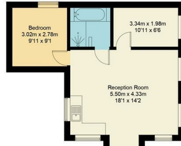
Outbuilding (Not Shown In Actual Location / Orientation)