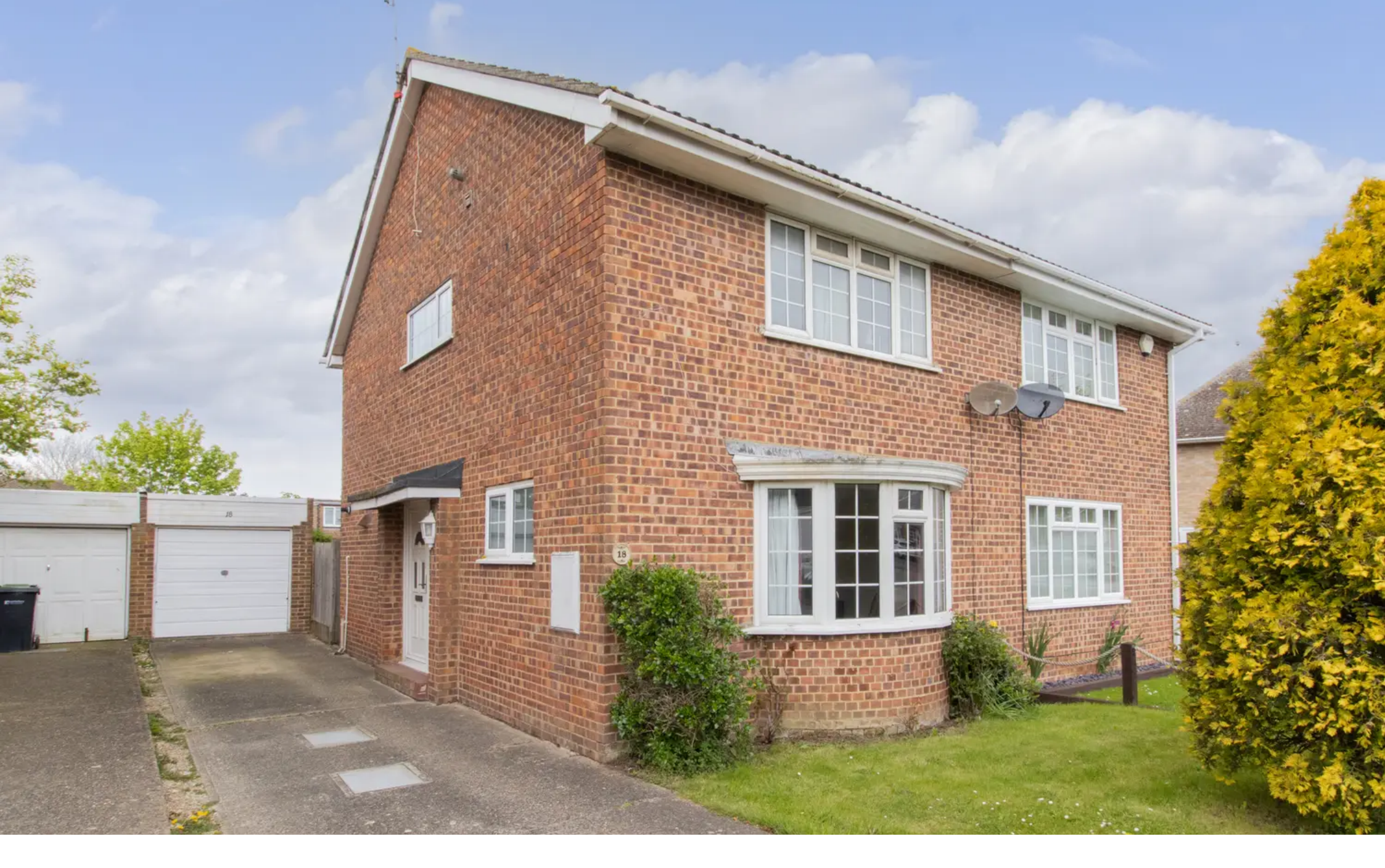
18 Sunningdale Walk, Herne Bay £325,000