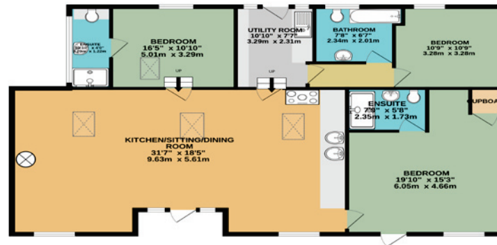
GROUND FLOOR 1343 sq.ft. (124.7 sq.m.) approx.