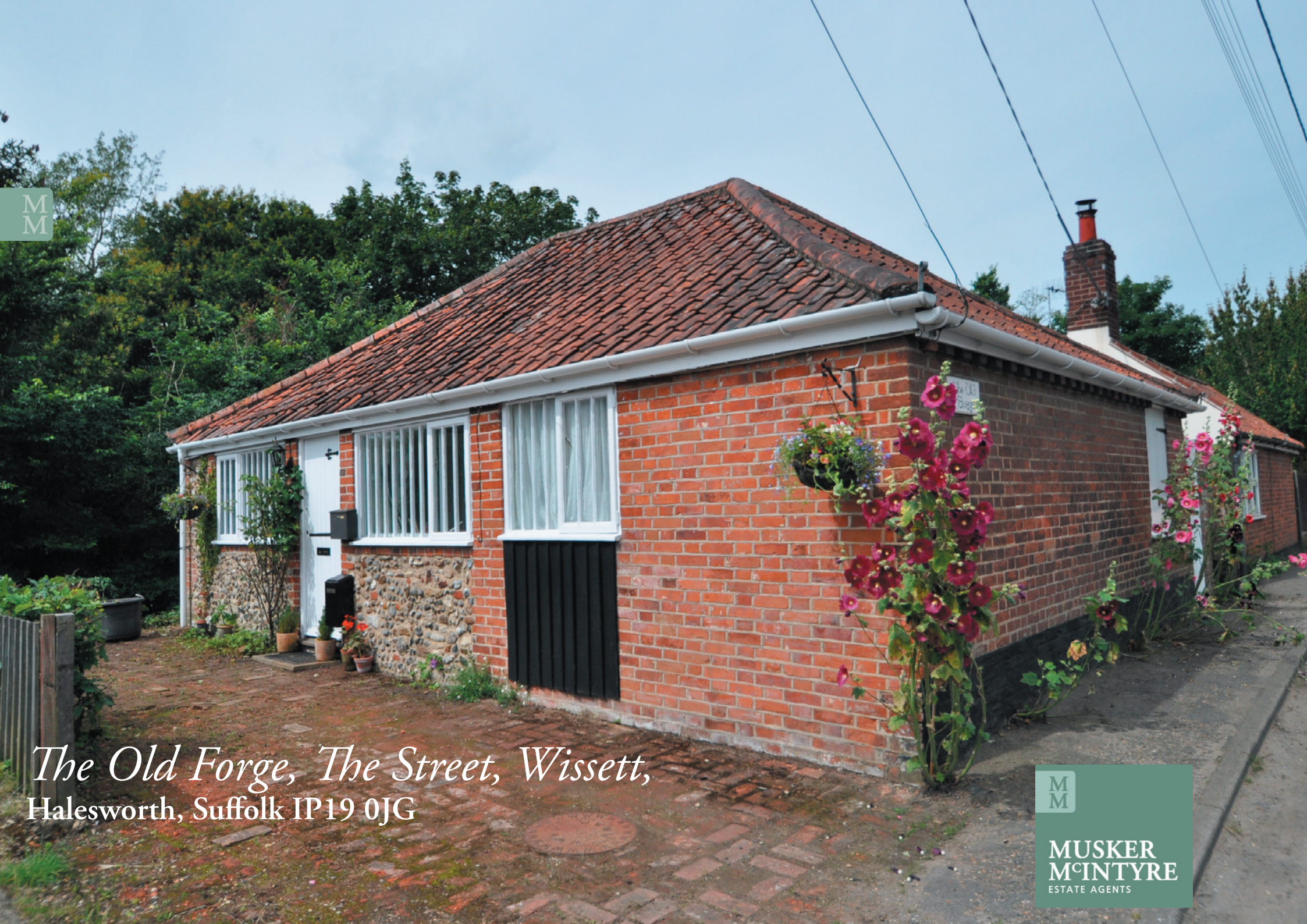
The Old Forge, The Street, Wissett, Halesworth, Suffolk IP19 0JG