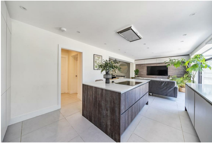
Open Plan Kitchen/Diner/Morning Room: