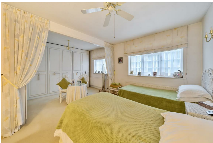
Bedroom One/Bedroom Two: