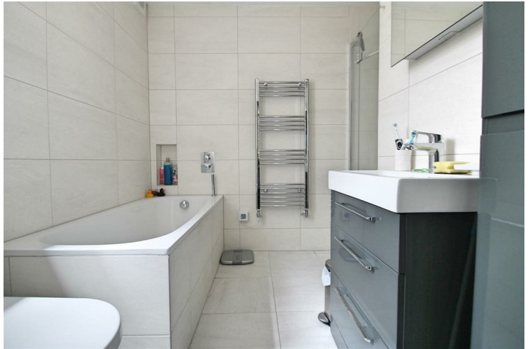
En-suite to Bedroom Two: