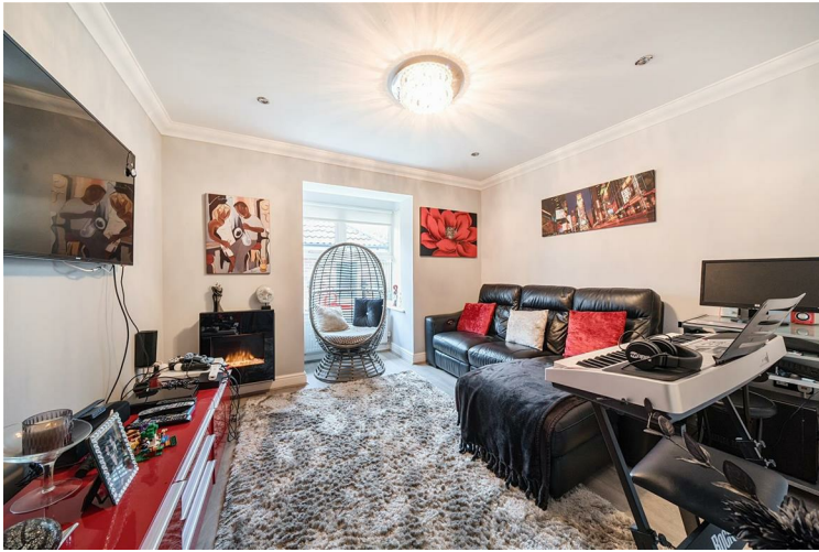
TV Room/Play Room: