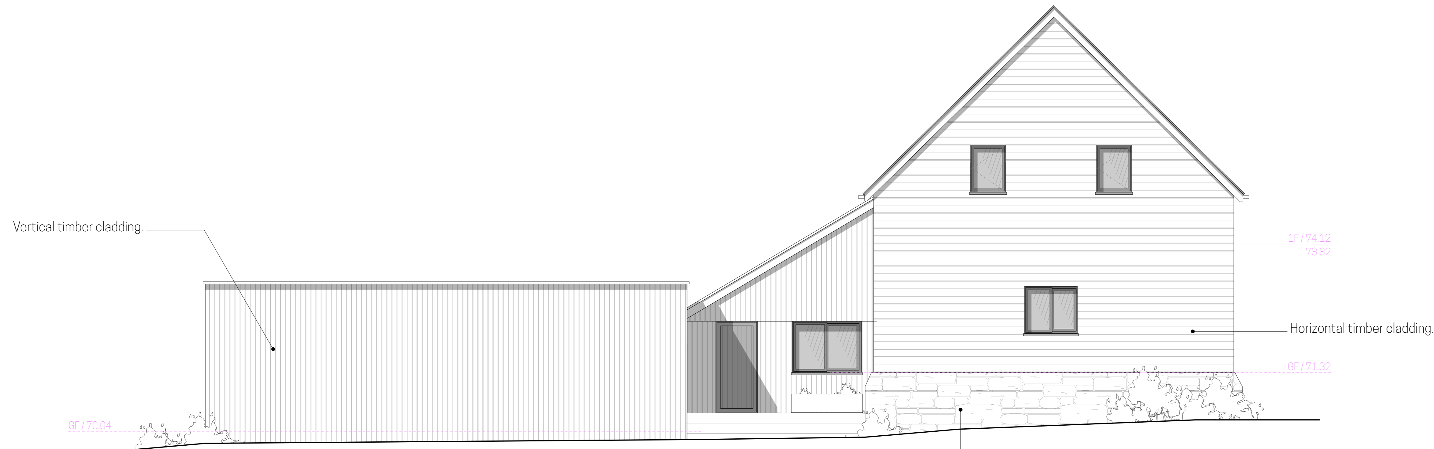
ELEVATION 04 [NORTH] 1:50 @ A1 / 1:100 @ A3