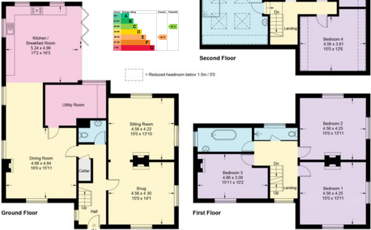
Illustration for identification purposes only. Measurements are accurate. Not to scale.

Smith & Co Estates use all reasonable endeavours to supply accurate property information in line with the Consumer Protection from Unfair trading Regulations 2008. These property details do not constitute any part of the offer or contract and all measurements are approximate. The matters in these particulars should be independently verified by prospective buyers. It should not be assumed that this property has all the necessary planning, building regulation or other consents. Any services, appliances and heating system(s) listed have not been checked or tested. Purchasers should make their own enquiries to the relevant authorities regarding the connection of any service. No person in the employment of Smith & Co Estates has any authority to make or give any representations or warranty whatever in relation to this property or these particulars or enter into any contract relating to this property on behalf of the vendor. Floor plan not to scale and for illustrative purposes only.