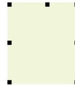
Car Port (Not Shown In Actual Location / Orientation)