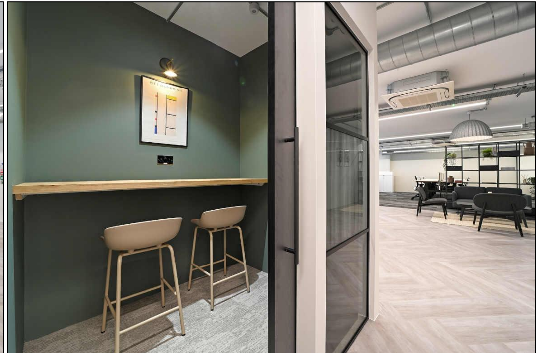
*photos of second floor