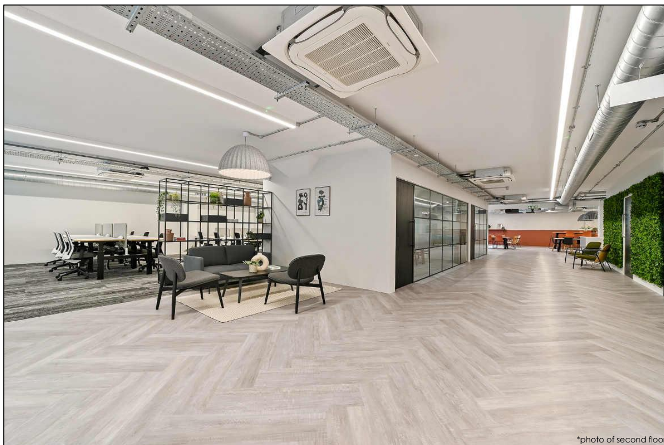
*photo of second floor

Third floor, 14 Bonhill Street, Shoreditch, London, EC2A 4BX