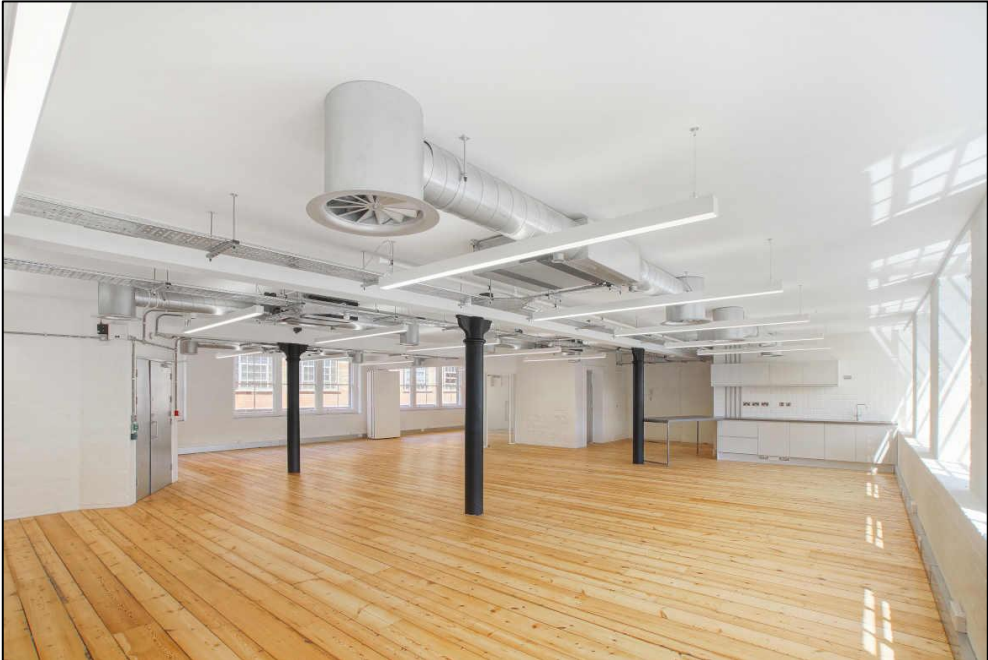
CONCERTINA MEETING / BOARD ROOM