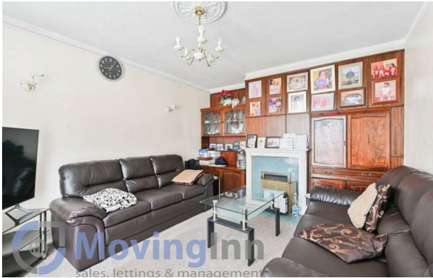
Howbury Road, Peckham, SE15 3HH