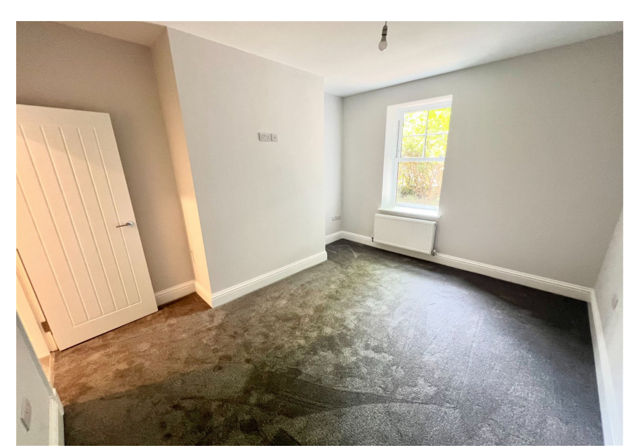
Tax Band: A Furnished: Unfurnished

A stunning 1 bedroom apartment situated in one of Barnsley's most iconic buildings, sympathetically restored resulting in a spacious home, contemporary styled in terms of design complimentary retaining original period features, finished to an exceptional standard, enjoying a private town centre location.