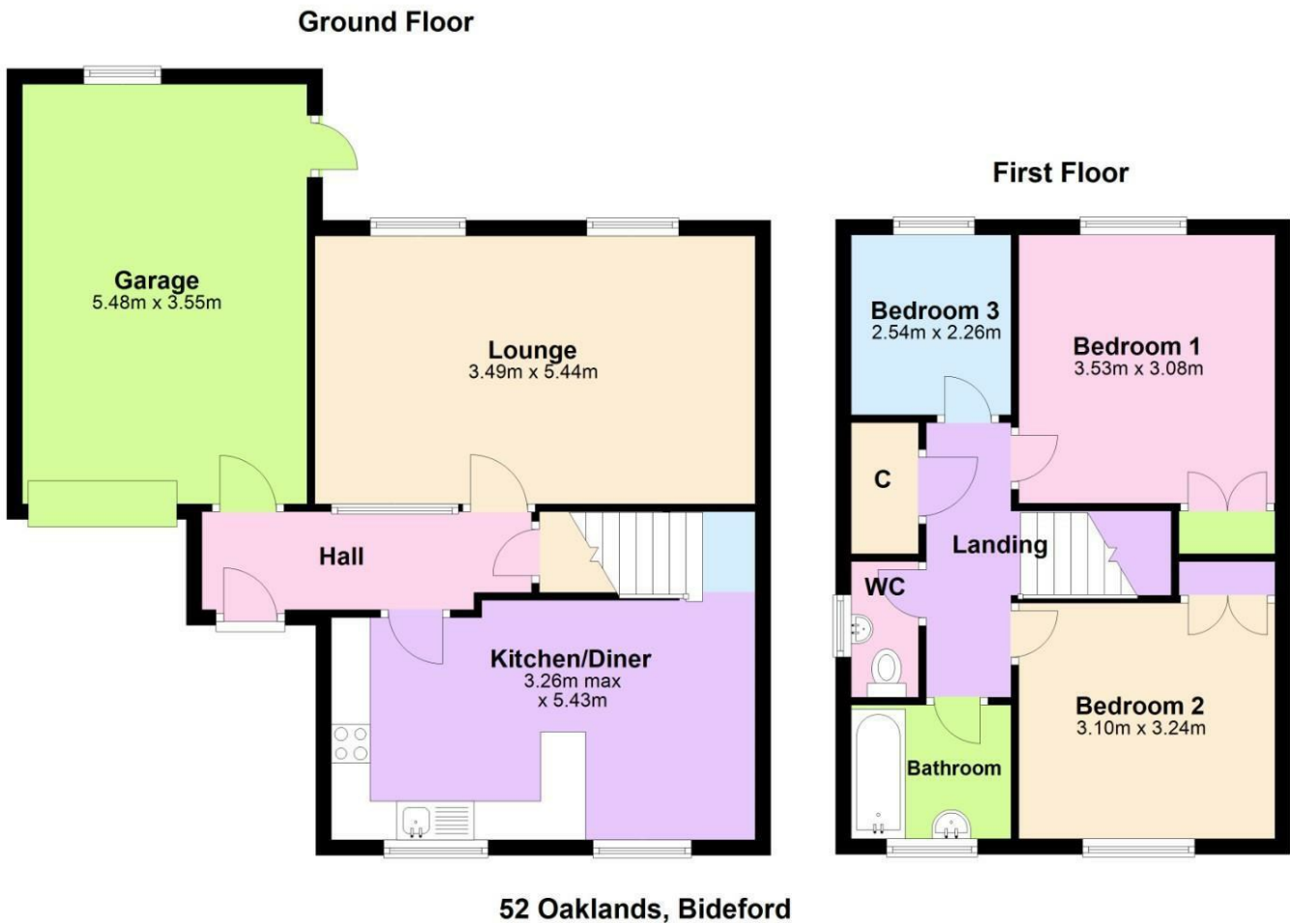
52 Oaklands, Bideford