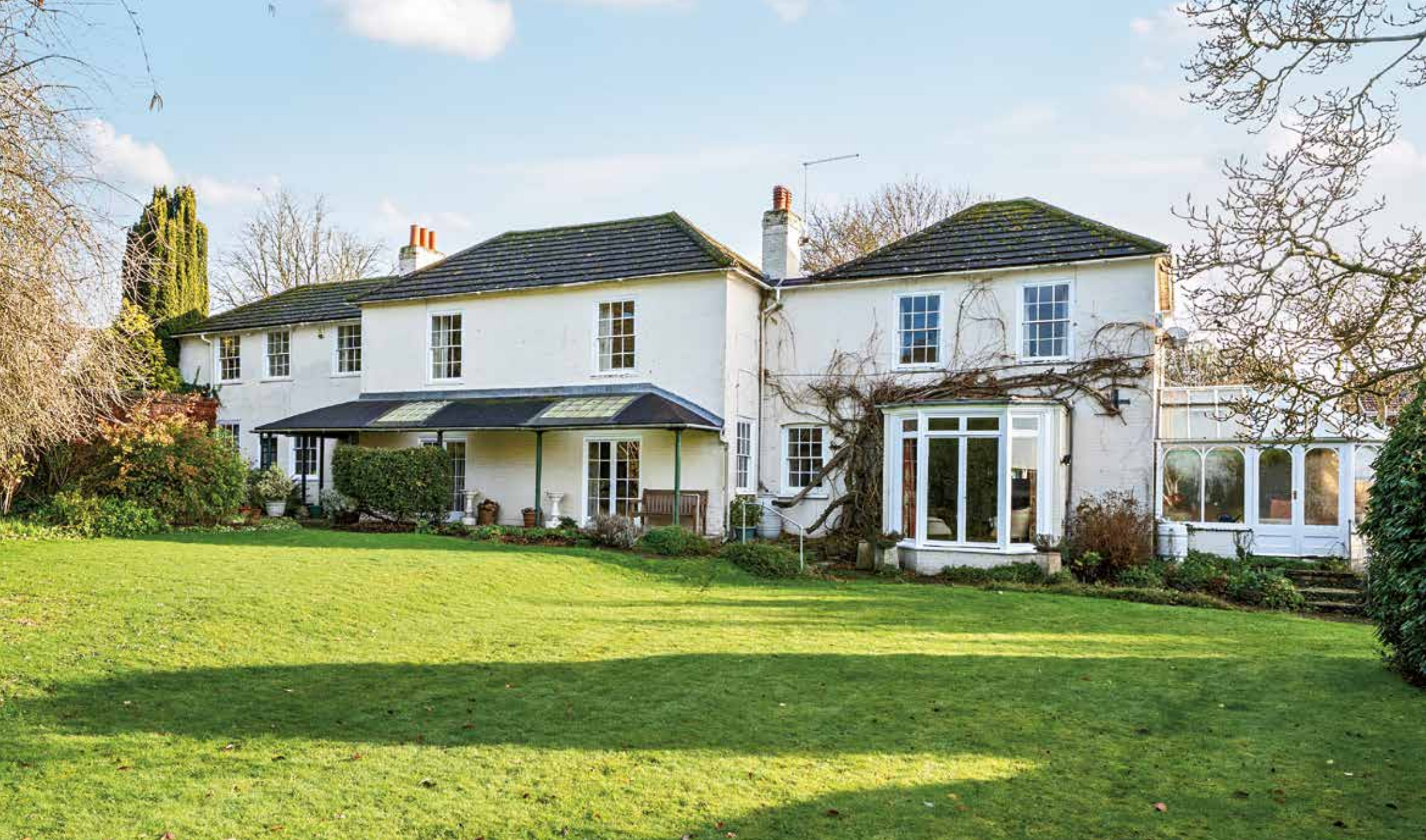
The Limes 201 Tonbridge Road | Waterringbury | Kent | ME18 5NY