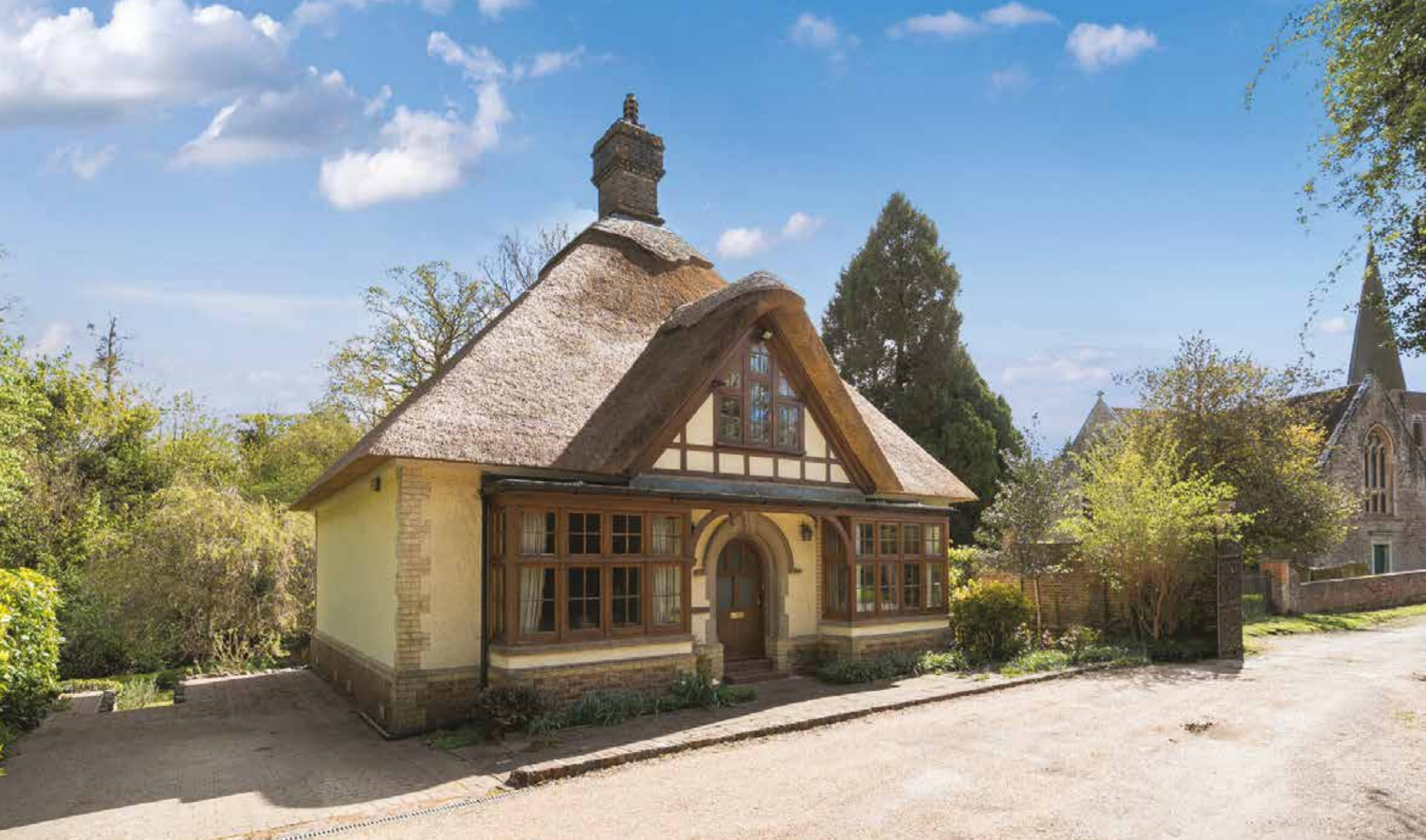
West Lodge Barham Court | Teston | Maidstone | Kent | ME18 5BZ