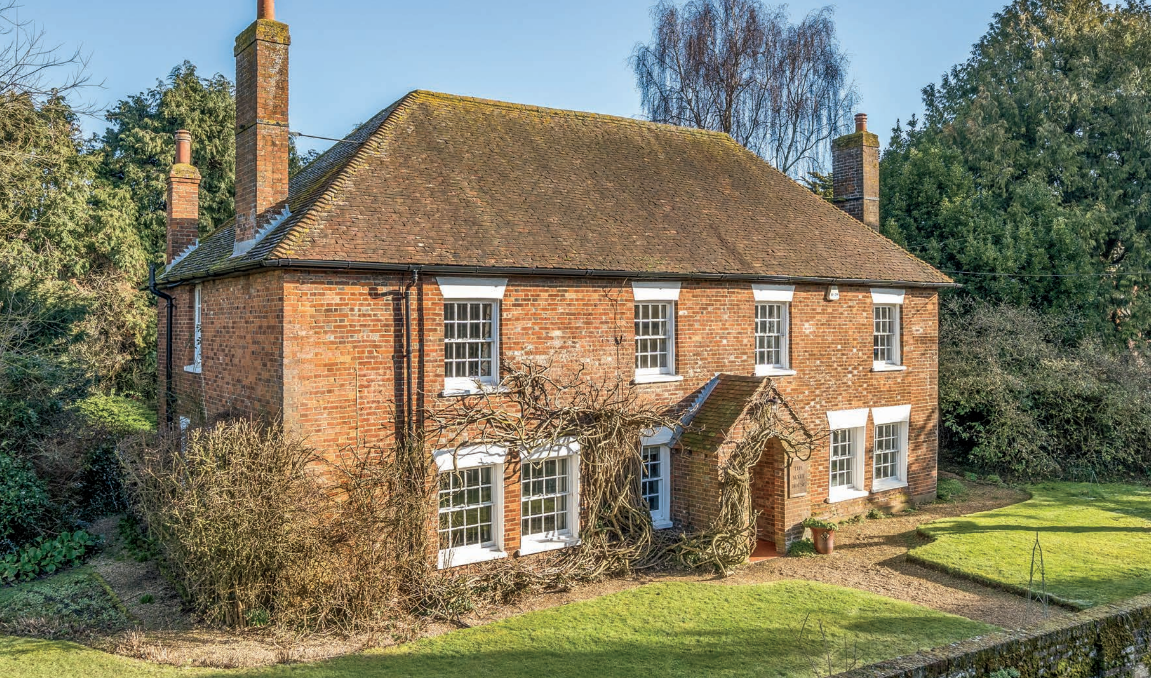
The Malt House Kingsdown | Lynsted | Kent | ME9 0RA