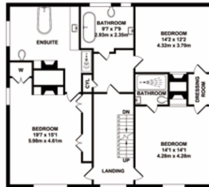
FIRST FLOOR 1225 sq.ft / 113.83 sq.m