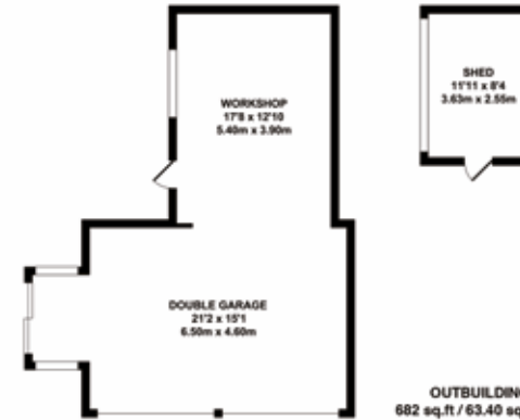
OUTBUILDINGS 682 sq.ft / 63.40 sq.m