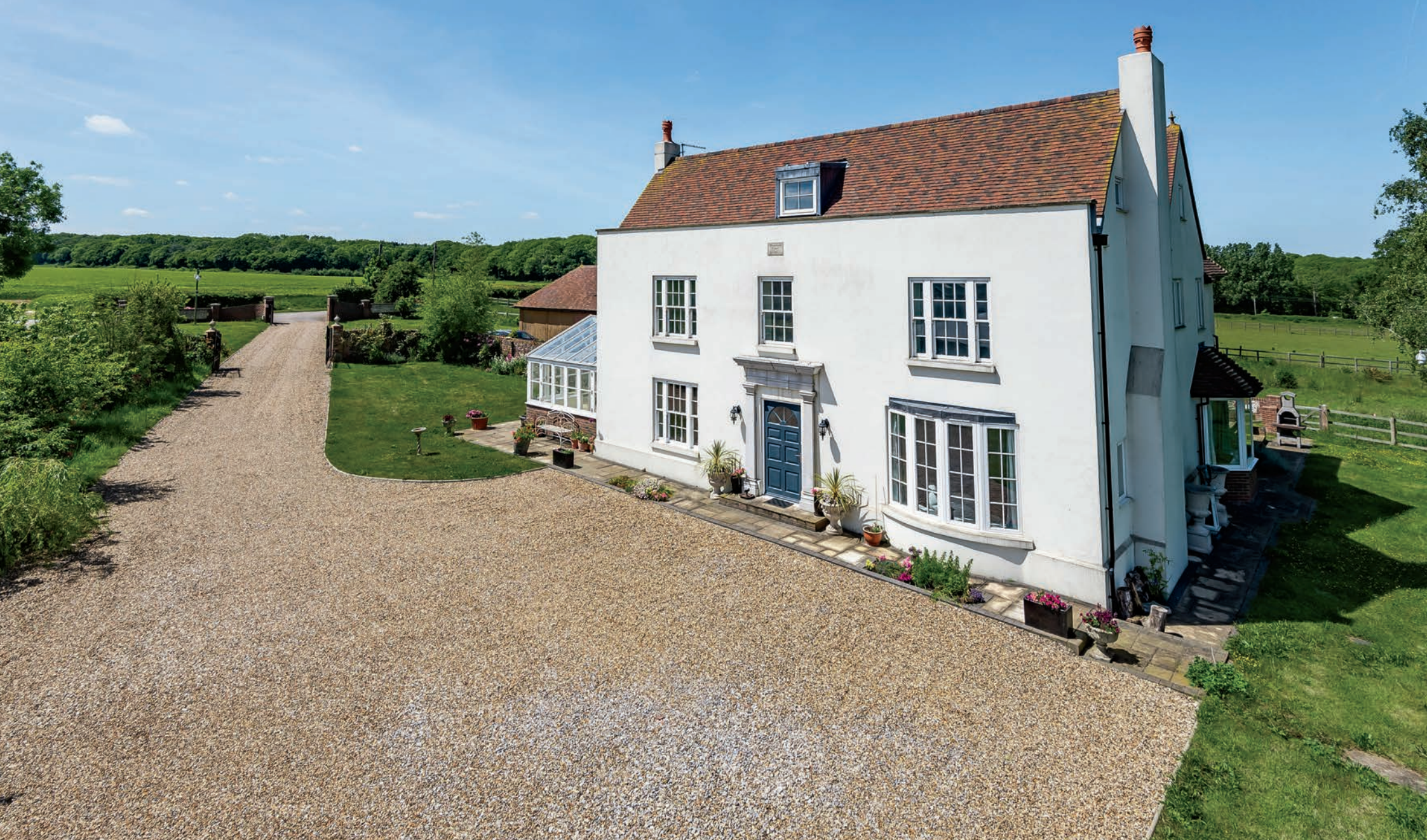
Rumstead Court Rumstead Lane | Stockbury | Sittingbourne | Kent | ME9 7RS