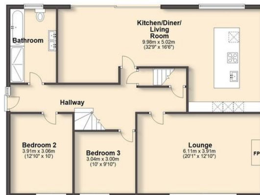
Ground Floor Approx. 112.3 sq. metres (1209.2 sq. feet)