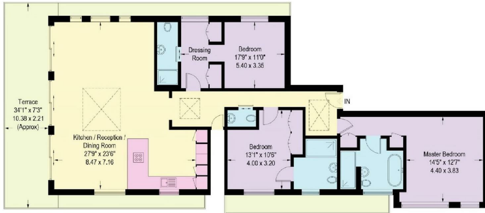
Illustration for identification purposes only, measurements are approximate, not to scale. (ID436478)

41 Heath Street Hampstead London NW3 6UA