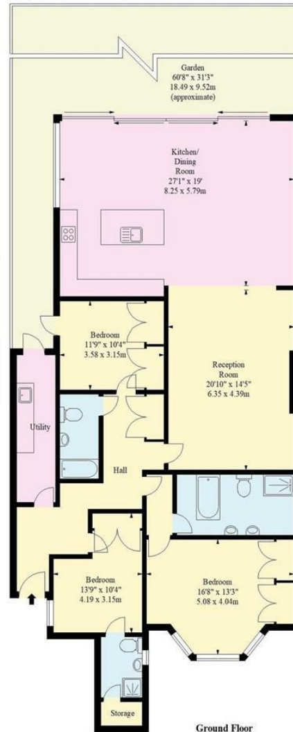
Illustration For Identification Purposes Only. Not To Scale

* As Defined by RICS - Code of Measuring Practice © International Floorplans. Tel 0094 115 345958 www.ifplk