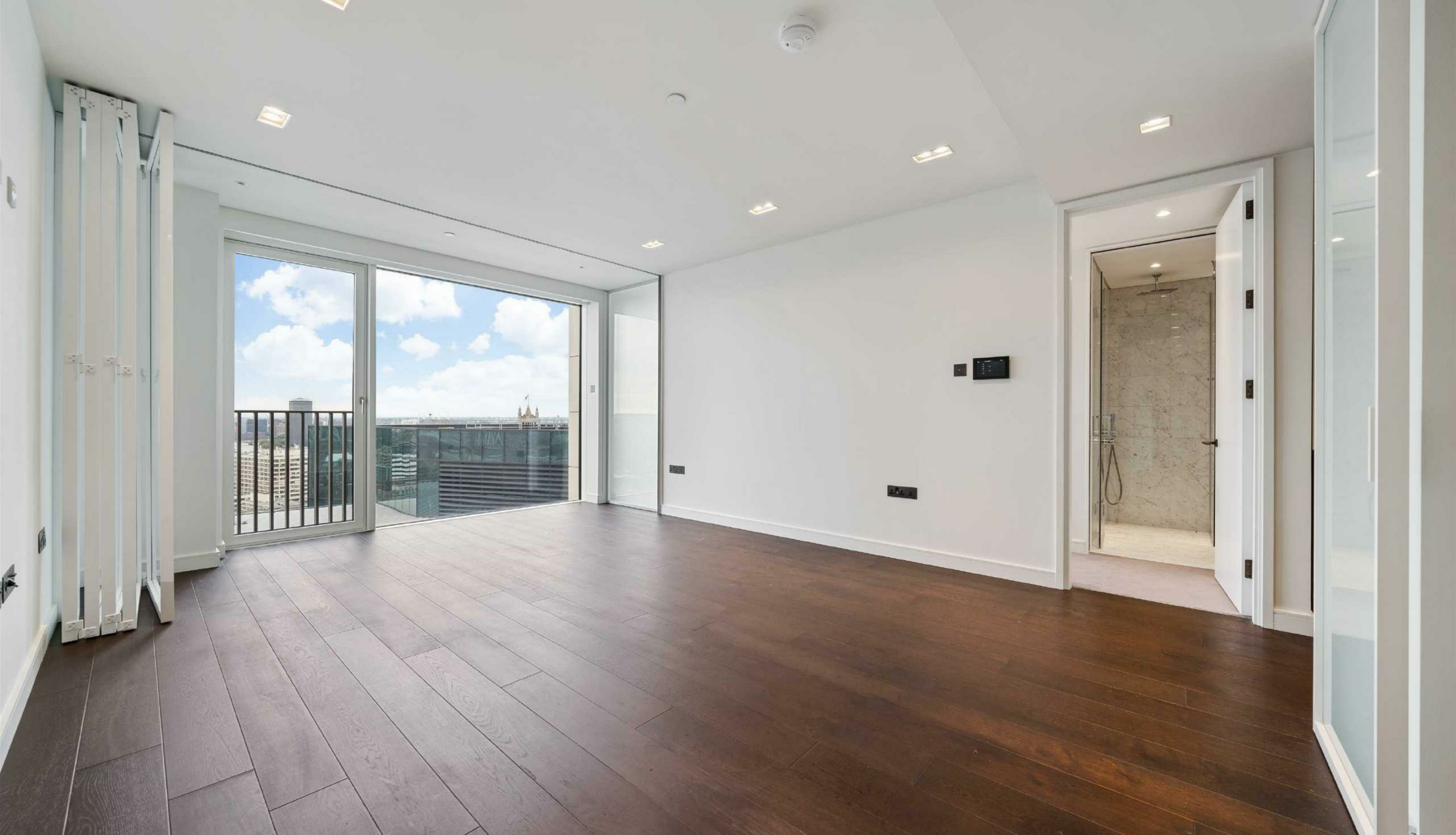
Casson Square, London SE1 7GU