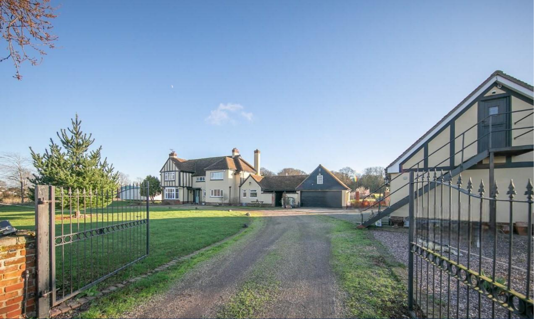
Gutteridge Hall, Gutteridge Hall Lane, Weeley, CO16 9AS Guide Price £925,000 Freehold