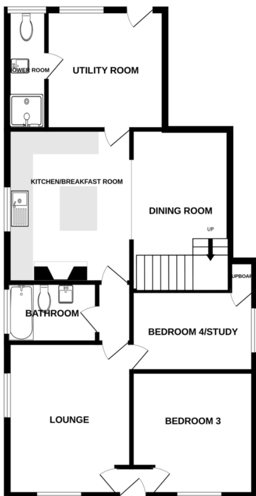
GROUND FLOOR 812 sq.ft. (75.5 sq.m.) approx.