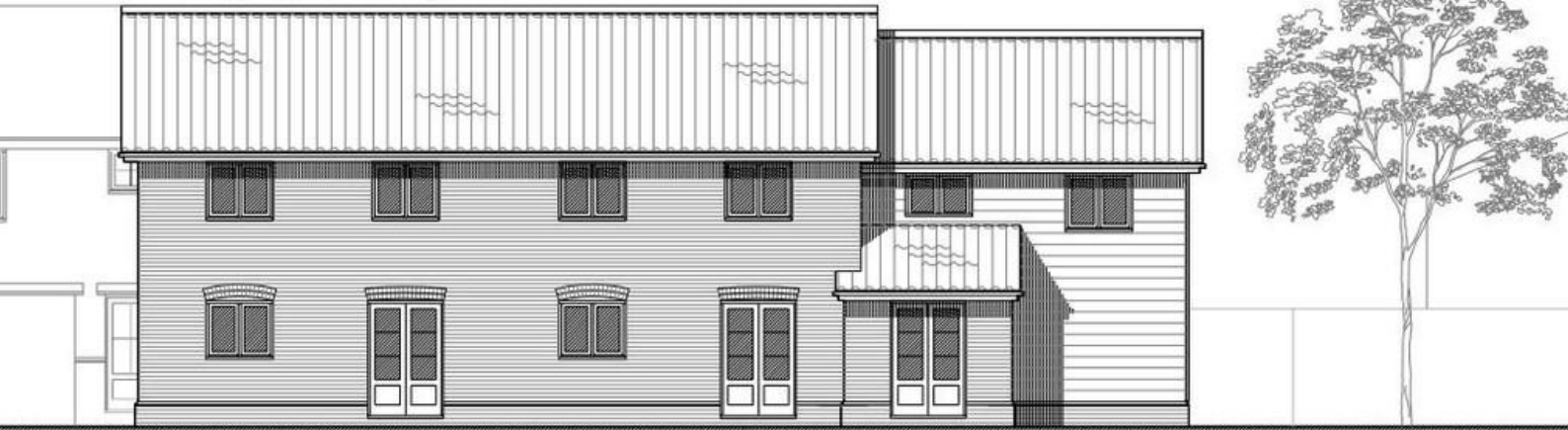
South West Elevation 1:100