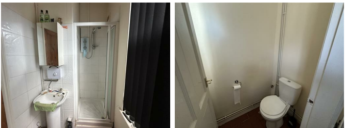
Shower room six