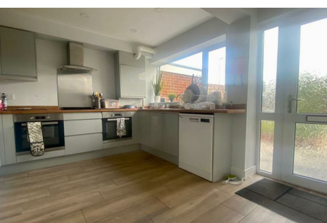
7 Hexby Close, Coventry, CV2 2BT £475

BILLS INCLUSIVE.......A first floor double bedroom in a shared house located only a short walk from Coventry Hospital. Briefly comprising of shared reception room with TV, fully fitted kitchen with appliances, double bedroom with double bed, wardrobe and draws, shared bathroom with one other tenant and shared access to a rear garden. WI-FI is included along with council tax, gas, electric and water. FULLY FURNISHED.