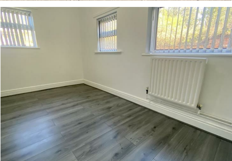
10b Middleborough Road, Coventry, CV1 4DD £895

AVAILABLE MID APRIL..... NEWLY CONVERTED...... MODERN....... Here we have a one bedroom ground floor flat as part of a house conversion located very close to the City Centre in Coundon, Coventry. Comprising of lounge, open plan kitchen with cooker, bathroom with bath and over head electric shower and double bedroom. There's a large shared rear garden and a driveway for 3-4 vehicles to the front. Gas Central Heating and Double Glazing and comes UNFURNISHED.