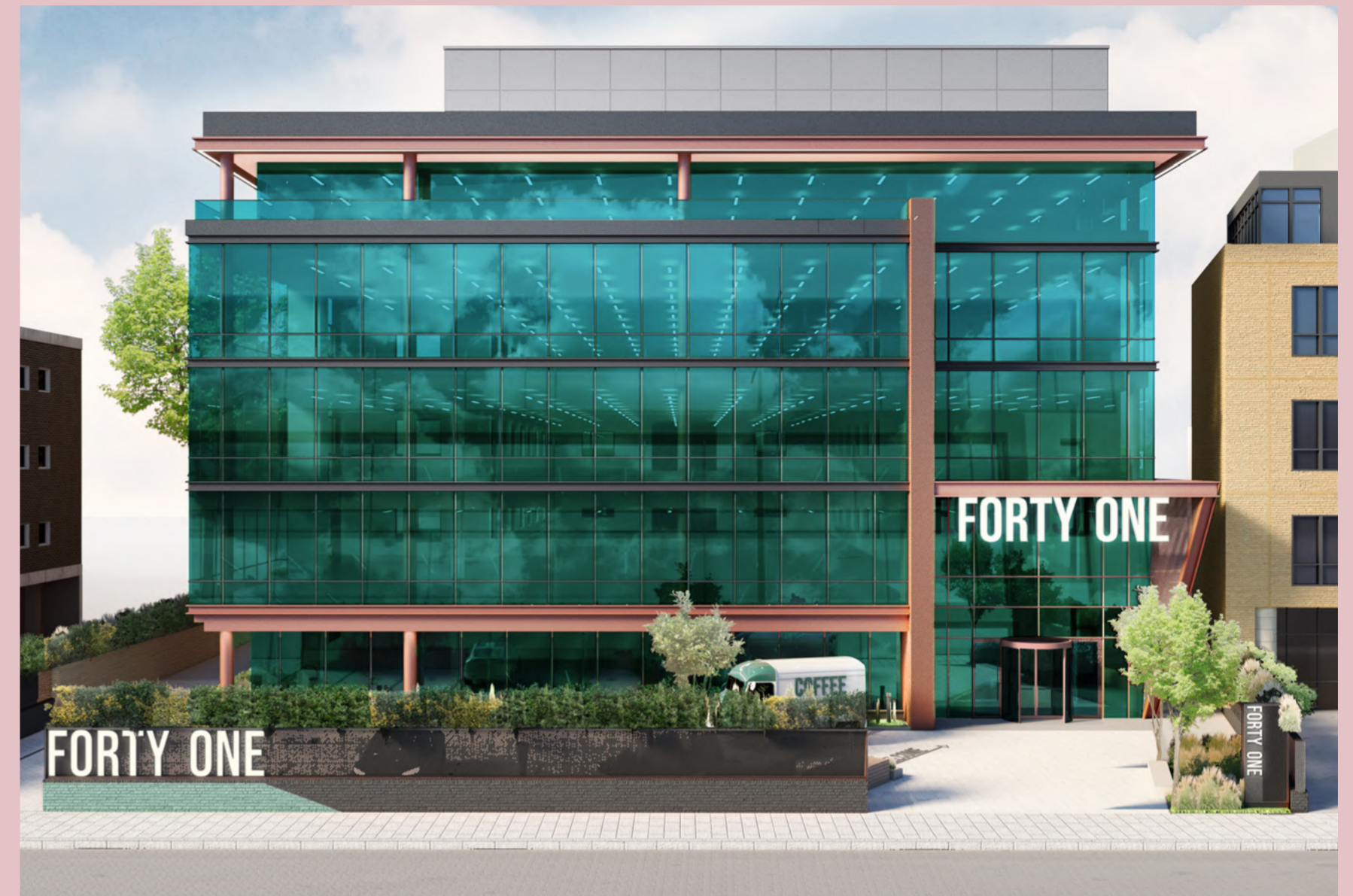
View from Clarendon Road