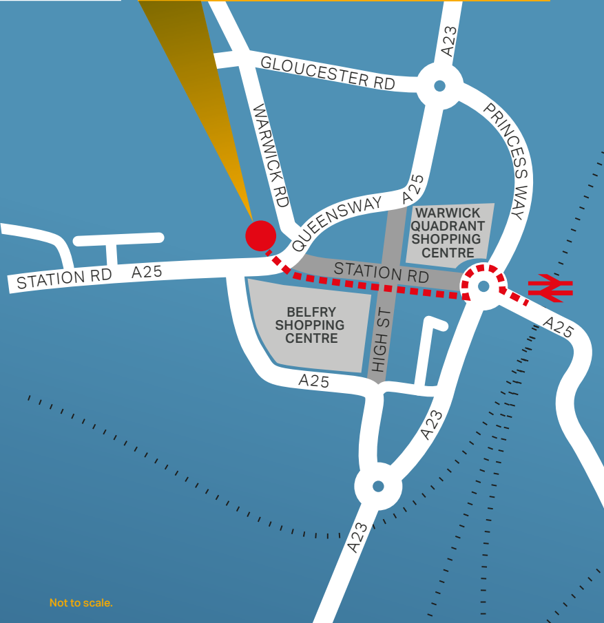
Not to scale.

The energy rating for this property has been graded as 72(C). A copy of the EPC is available upon request.