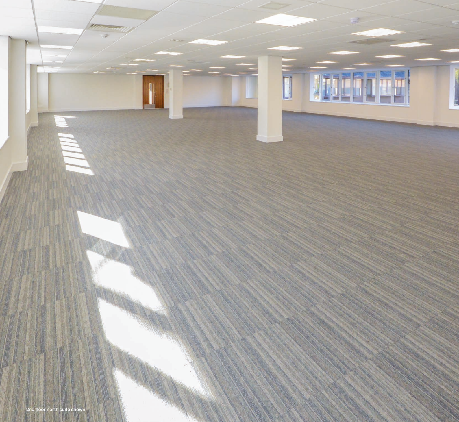
2nd floor north suite shown