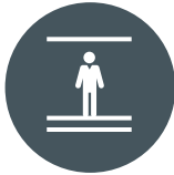
FULL ACCESS RAISED FLOORS