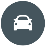
EXCELLENT PARKING RATIO OF 1:241 SQ FT