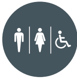
MALE, FEMALE & DISABLED WC'S