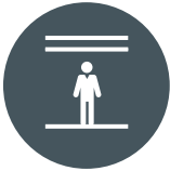
METAL SUSPENDED CEILINGS