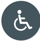
FULLY DDA COMPLIANT