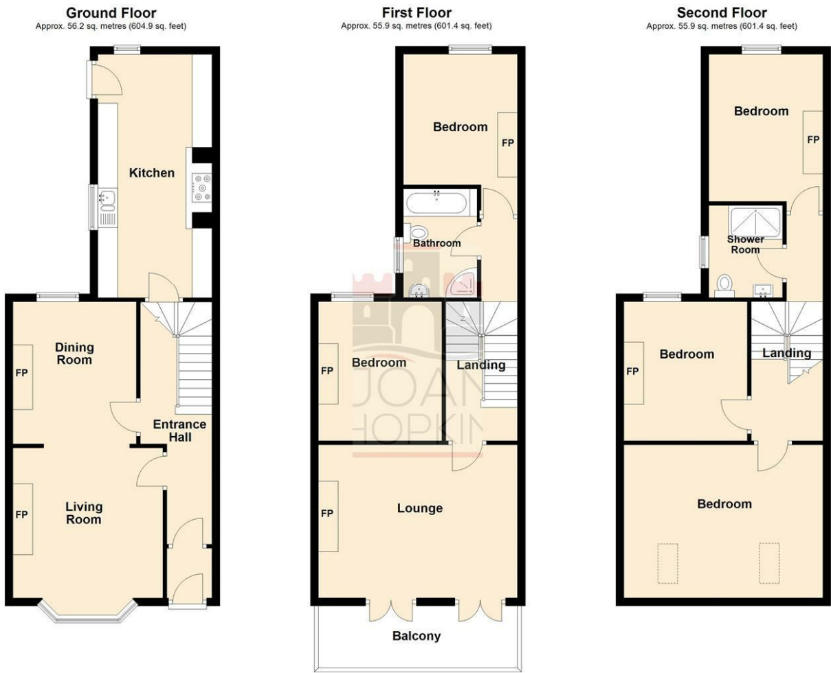
Total area: approx. 167.9 sq. metres (1807.8 sq. feet)