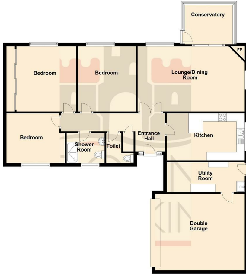
Total area: approx. 142.7 sq. metres (1535.9 sq. feet)

This floor plan is for illustrative purposes only and may not be representative of the property. The measurements are approximate and are for illustrative purposes only. Plan produced using PlanUp.